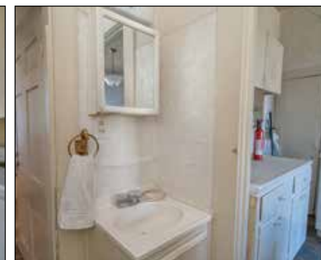
FIRST FLOOR BATHROOM