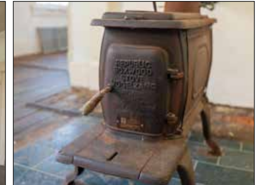
OLD REPUBLIC BOXWOOD STOVE