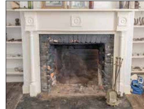
LIVING ROOM FIREPLACE